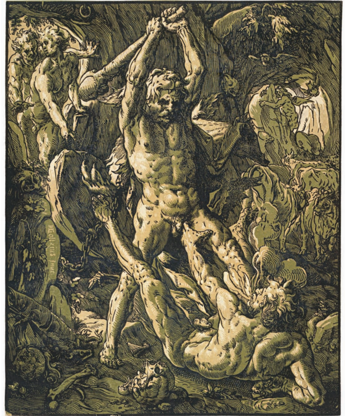
Cat. 103 Hendrick Goltzius Hercules Killing Cacus, 1588 Chiaroscuro woodcut printed from three blocks, the tone blocks in yellow and green 41.1 x 33.3 cm Collection Georg Baselitz

Why might Goltzius want to control all stages of the printmaking process?