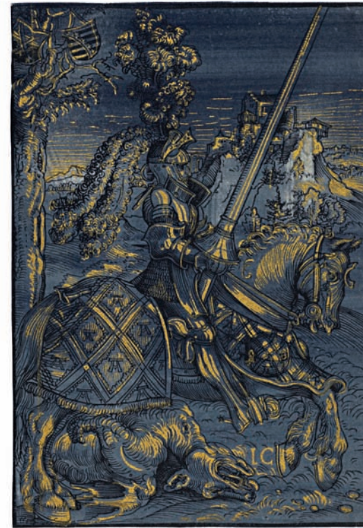
Fig.1 Lucas Cranach the Elder St George, c.1505–10 Colour woodcut printed from two blocks 23.3 x 15.9 cm The British Museum, London © Trustees of the British Museum

'I have, together with my artists, discovered a method of printing in gold and silver on parchment and paper.' Conrad Peutinger, writing to Duke Georg of Saxony, 24 September 1508