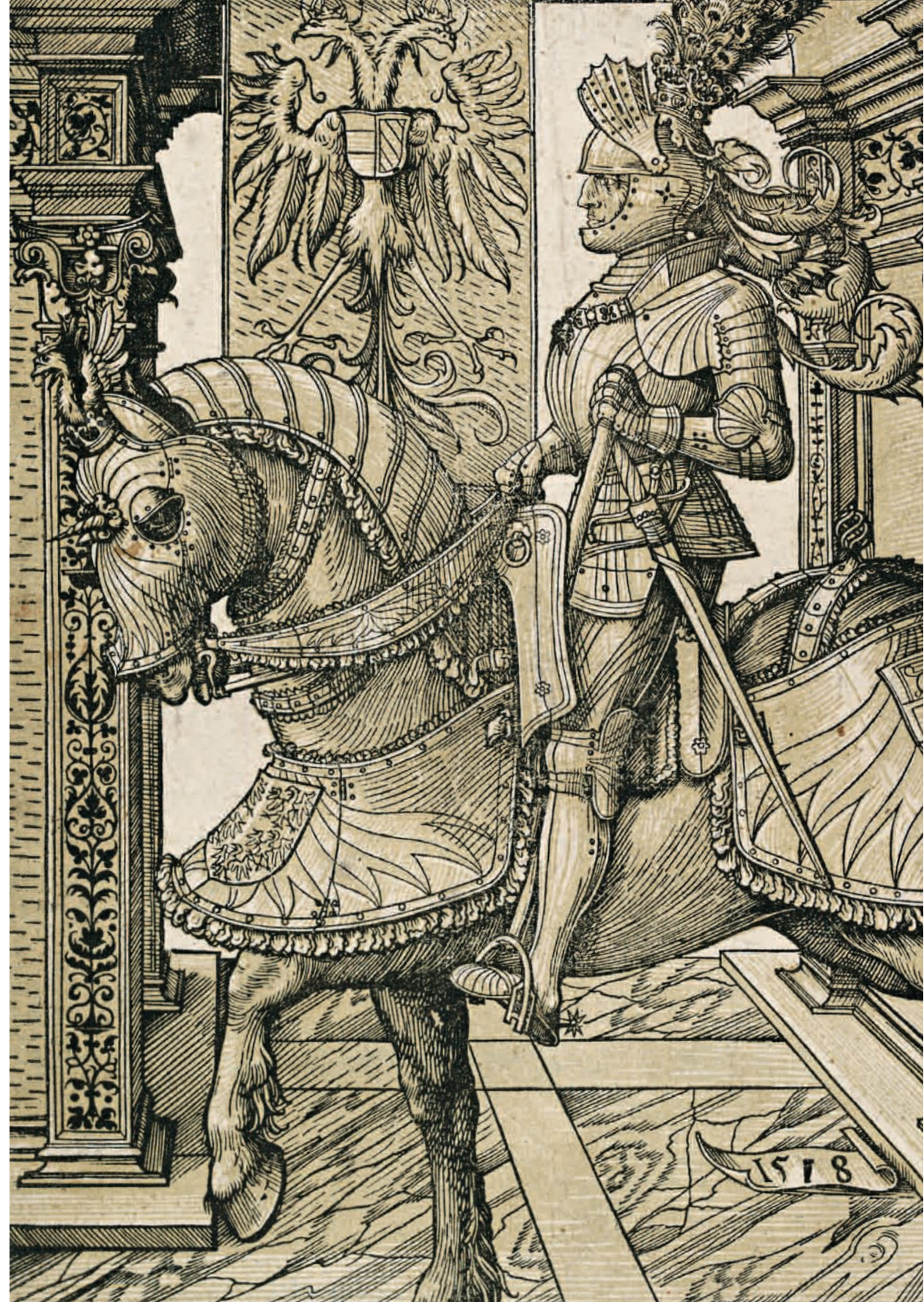
Cat. 2 (detail) Hans Burgkmair the Elder Emperor Maximilian on Horseback