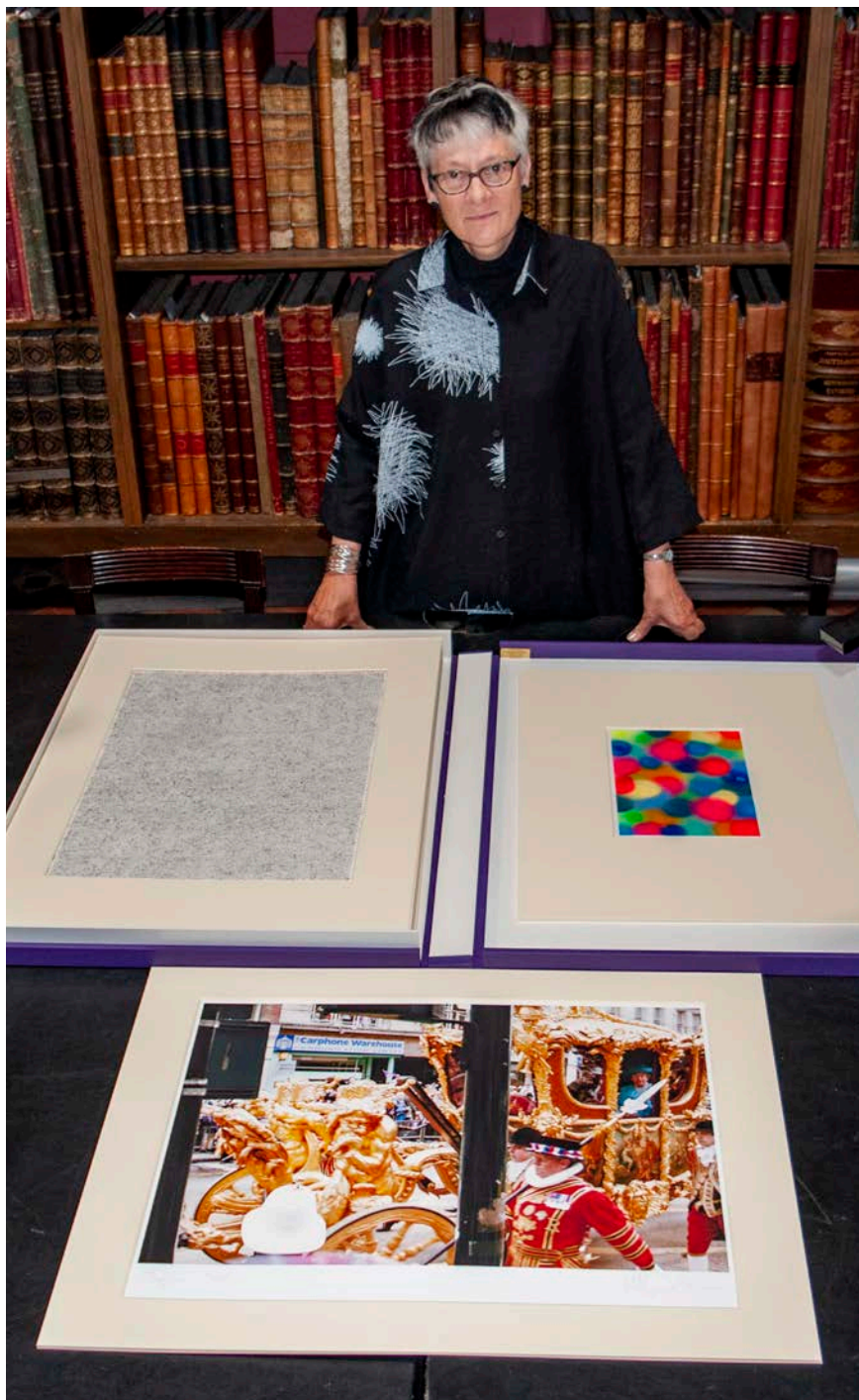
Rebecca Salter PRA President of the Royal Academy