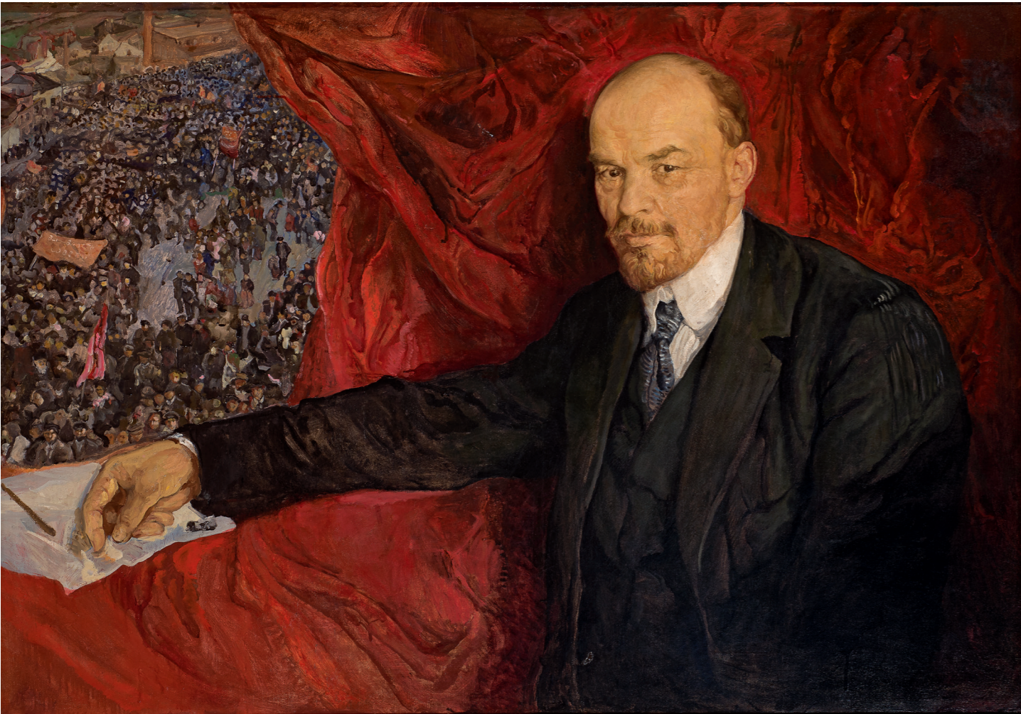
Isaak Brodsky Vladimir Lenin and a Demonstration , 1919 Oil on canvas, 90 x 135 cm

One of the leading Socialist Realists, Brodsky was known for painting revolutionary events and leaders of the Communist movement. He painted Lenin several times, even posthumously. He was a key member, alongside Boris Kustodiev and Konstantin Yuon, of the Association of Artists of Revolutionary Russia (AKhRR), which was set up in 1922. The same year the group staged at an exhibition called 'Paintings by Realist Artists to Help the Starving'.