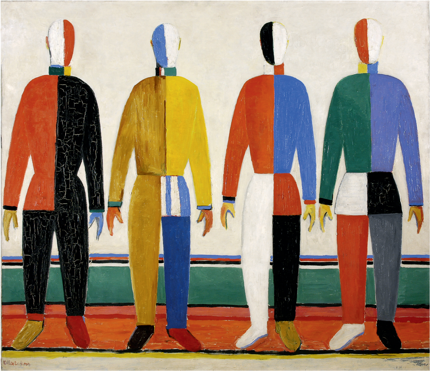
Kazimir Malevich Sportsmen , 1930-31 Oil on canvas, 142 x 164 cm

State Russian Museum, St Petersburg