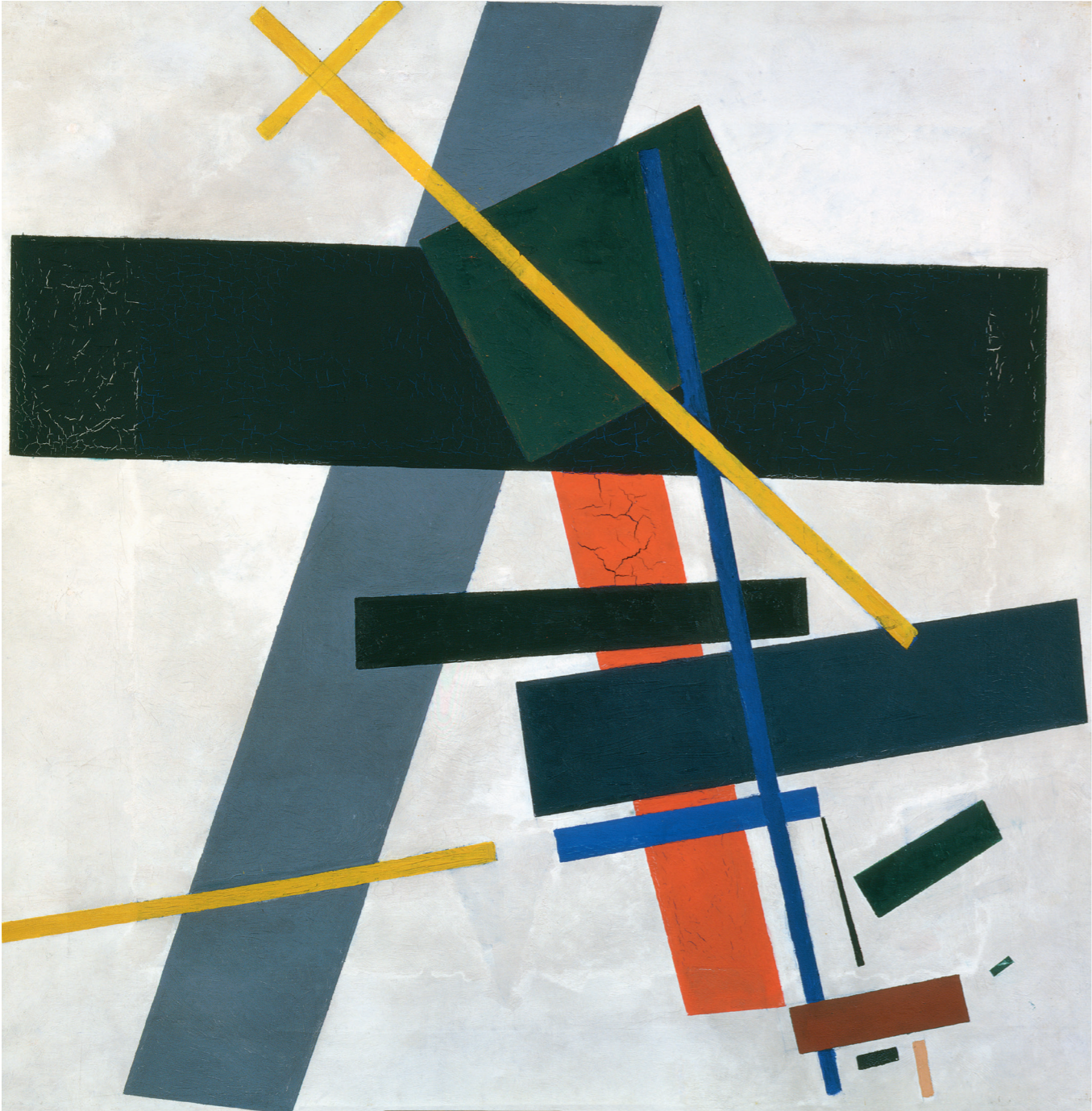
Kazimir Malevich Suprematism , 1915-16 Oil on canvas, 80.5 x 81 cm

Malevich continued to work in this geometric, bold style, exhibiting his Suprematist works alongside his more "figurative" work in the 1932 exhibition organised by Nikolai Punin. He tried to make the case that his Suprematist works had been a precursor to the political revolution. His works of the early 1930s depicted peasants, workers and sportsmen but did not fit the doctrine of Socialist Realism. Instead, these faceless figures protested the damaging policies of collective farming under Stalin.