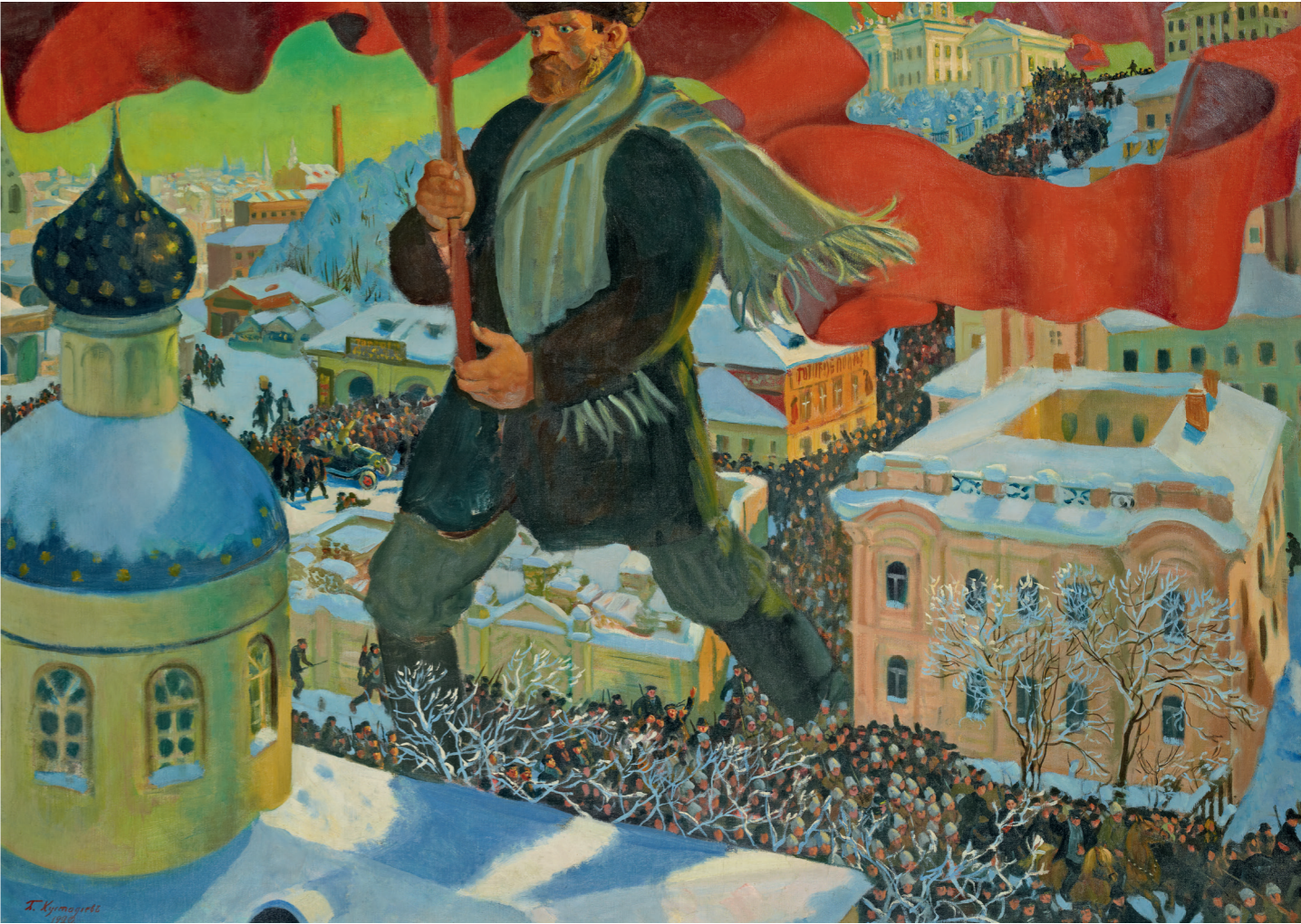
Boris Kustodiev The Bolshevik , 1920 Oil on canvas, 101 x 140.5 cm

Primarily a portraitist and painter, Kustodiev depicted mass demonstrations and workers in support of the revolution. As living conditions worsened and the initial euphoria dispersed, he soon began to criticize the regime, painting pieces such as The Bolshevik , 1920, a metaphor for the crude force that had risen over the country. He created designs for the State Porcelain Museum in St. Petersburg from 1923.