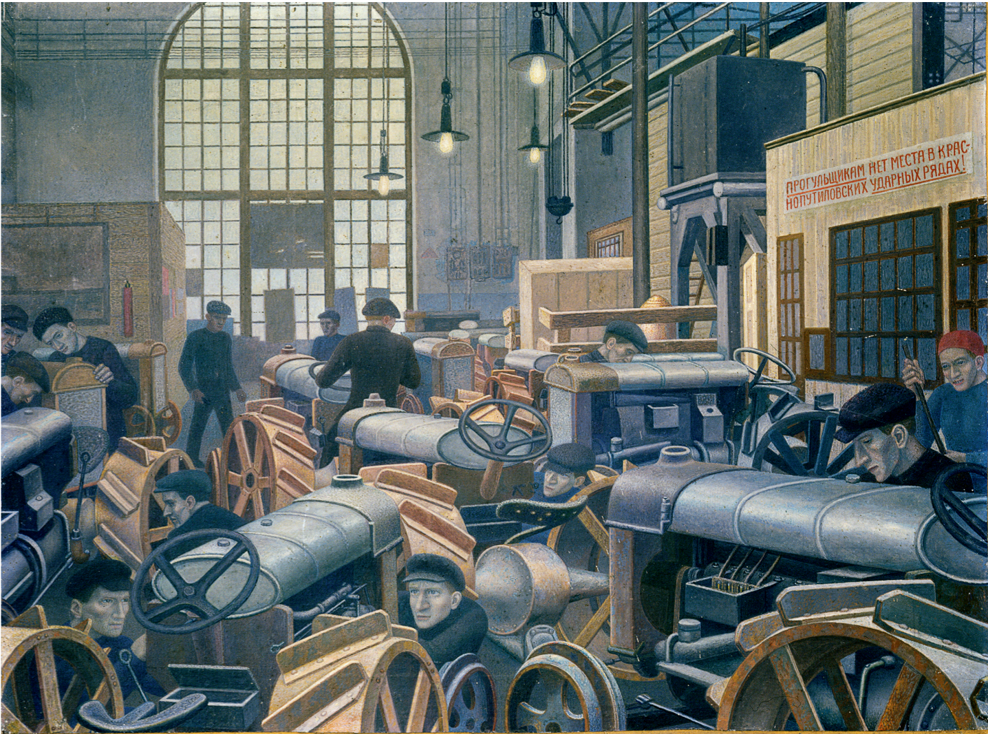
Pavel Filonov Tractor Workshop at the Putilov Factory , 1931-32 Oil on canvas mounted on cardboard, 73 x 99 cm

State Russian Museum, St Petersburg