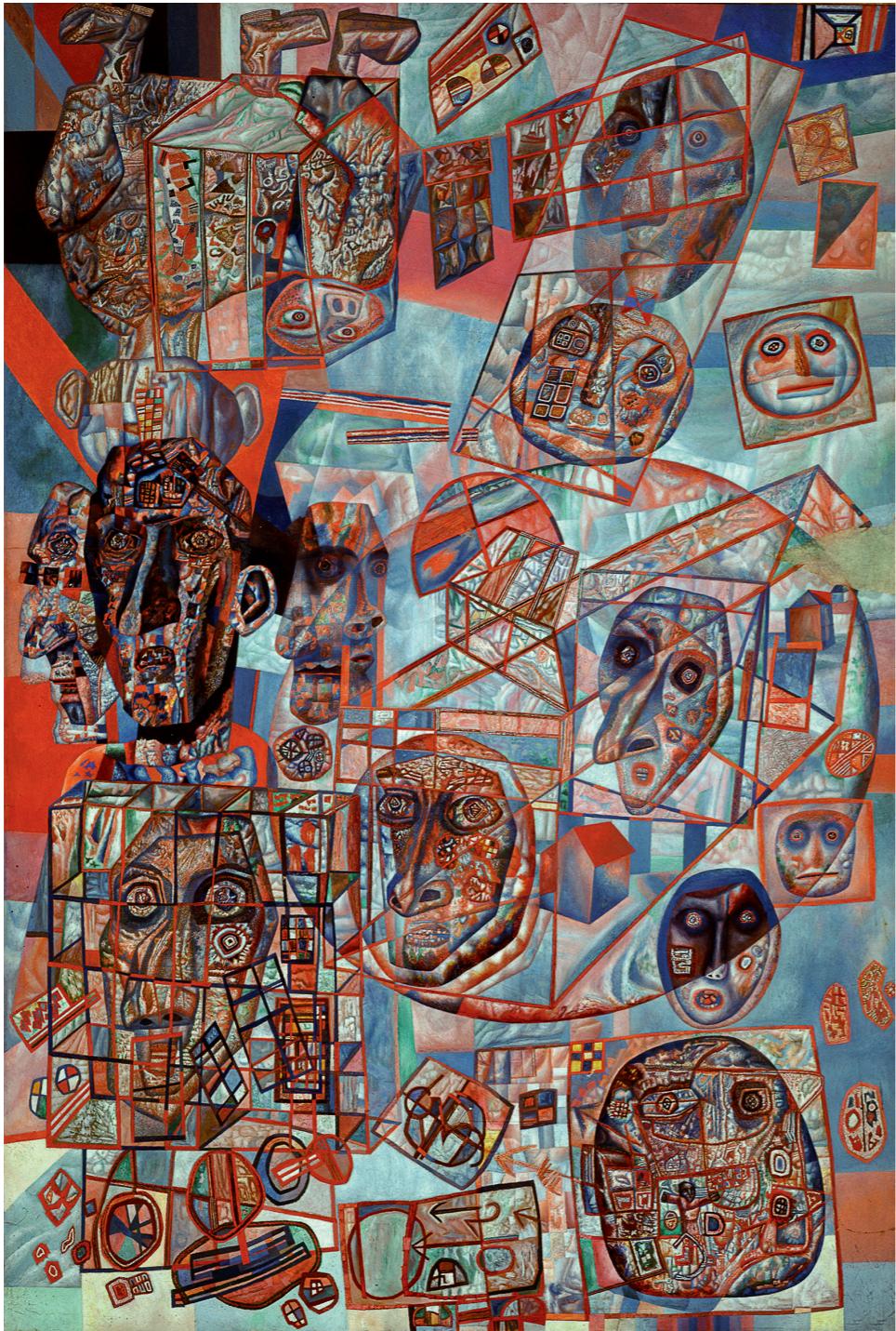
Pavel Filonov Heads (Human in the World) , 1925-26 Oil on paper mounted on canvas, 109 x 72.7 cm

commissions in the official Socialist Realist style, in order to survive. He continued to resist and he made paintings that were realistic in aesthetic but that did not conform to the doctrine of Socialist Realism. He insisted his 'ideology will find its own path...', and continued painting in his analytical realist style. He starved to death in the Siege of Leningrad in 1941.