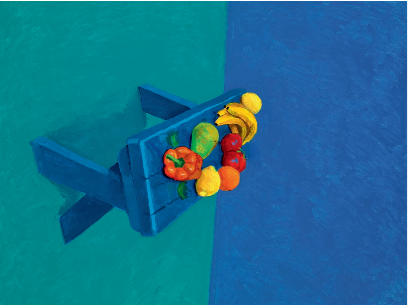
Cat. 35 Fruit on a Bench 6th, 7th, 8th March 2014 Acrylic on canvas, 121.9 x 91.4 cm

'Landscape and portraiture are the two subjects modernists said you couldn't do anymore. But you can, everything is open now. Landscape and portraiture remain infinite!'