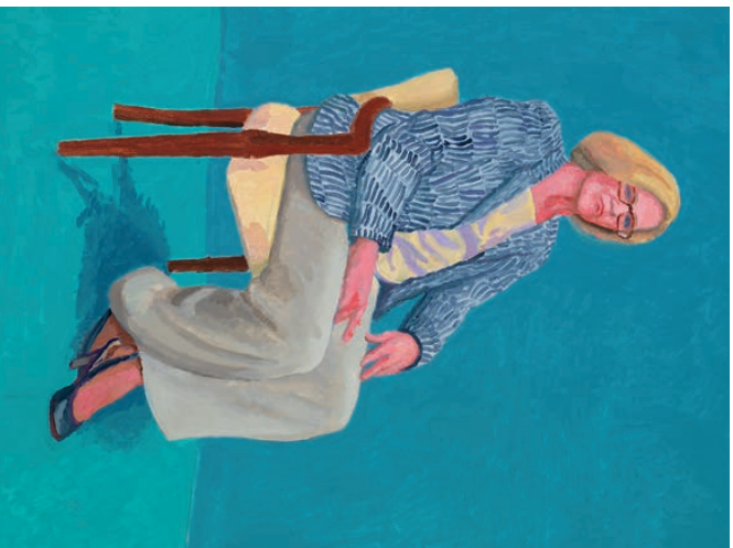
top left Cat. 22 Dagny Corcoran, 15th, 16th, 17th January 2014 Acrylic on canvas, 121.9 x 91.4 cm