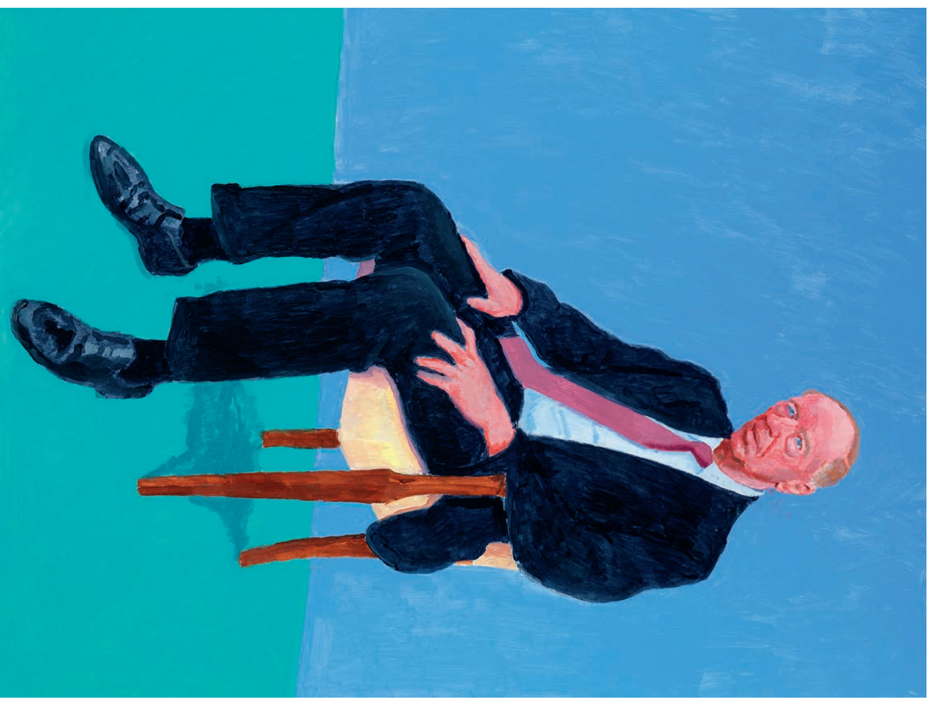
Cat. 27 Jacob Rothschild, 5th, 6th February 2014 Acrylic on canvas, 121.9 x 91.4 cm

How does Hockney convey in his portraits the differences between the diverse array of personalities? In the exhibition, whose personality do you think is shown the most clearly? Why?