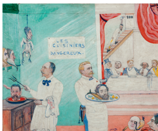
Above: James Ensor The Dangerous Cooks , 1896 Oil on panel, 38 x 46 cm Private Collection, Knokke Photo © private collection / © DACS 2016