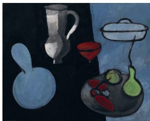
Above: Henri Matisse, Gourds, Issy-les-Moulineaux, 1915-16 Oil on canvas, 65.1 x 80.9 cm The Museum of Modern Art, New York. Mrs. Simon Guggenheim Fund, 109.1935