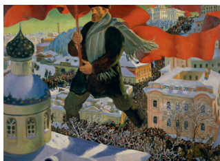
Above: Boris Mikailovich Kustodiev, Bolshevik , 1920 Oil on canvas, 101 x 140.5 cm State Tretyakov Gallery