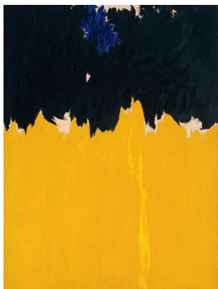
Above: Clyfford Still, PH-950, 1950, Oil on canvas, 233.7 x 177.8 cm Clyfford Still Museum, Denver © City and County of Denver / DACS 2016