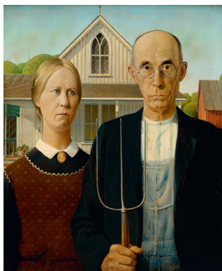
Above: Grant Wood, American Gothic , 1930 Oil on beaver board, 78 x 65.3 cm Friends of American Art Collection 1930-934, The Art Institute of Chicago