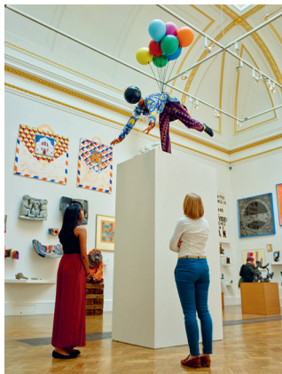
Above: View of the Lecture Room, Summer Exhibition 2016