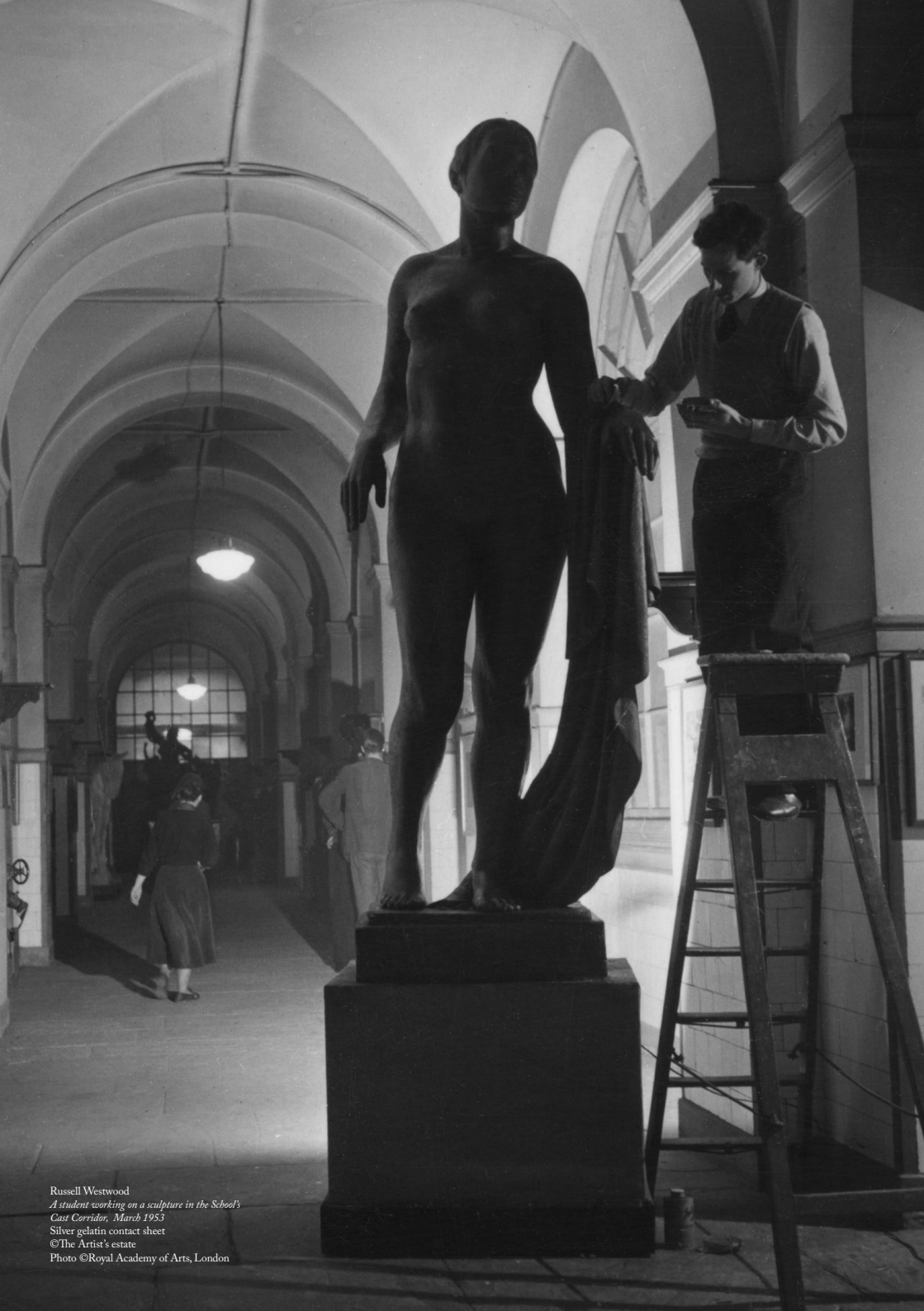
Russell Westwood A student working on a sculpture in the School's Cast Corridor, March 1953 Silver gelatin contact sheet ©The Artist's estate