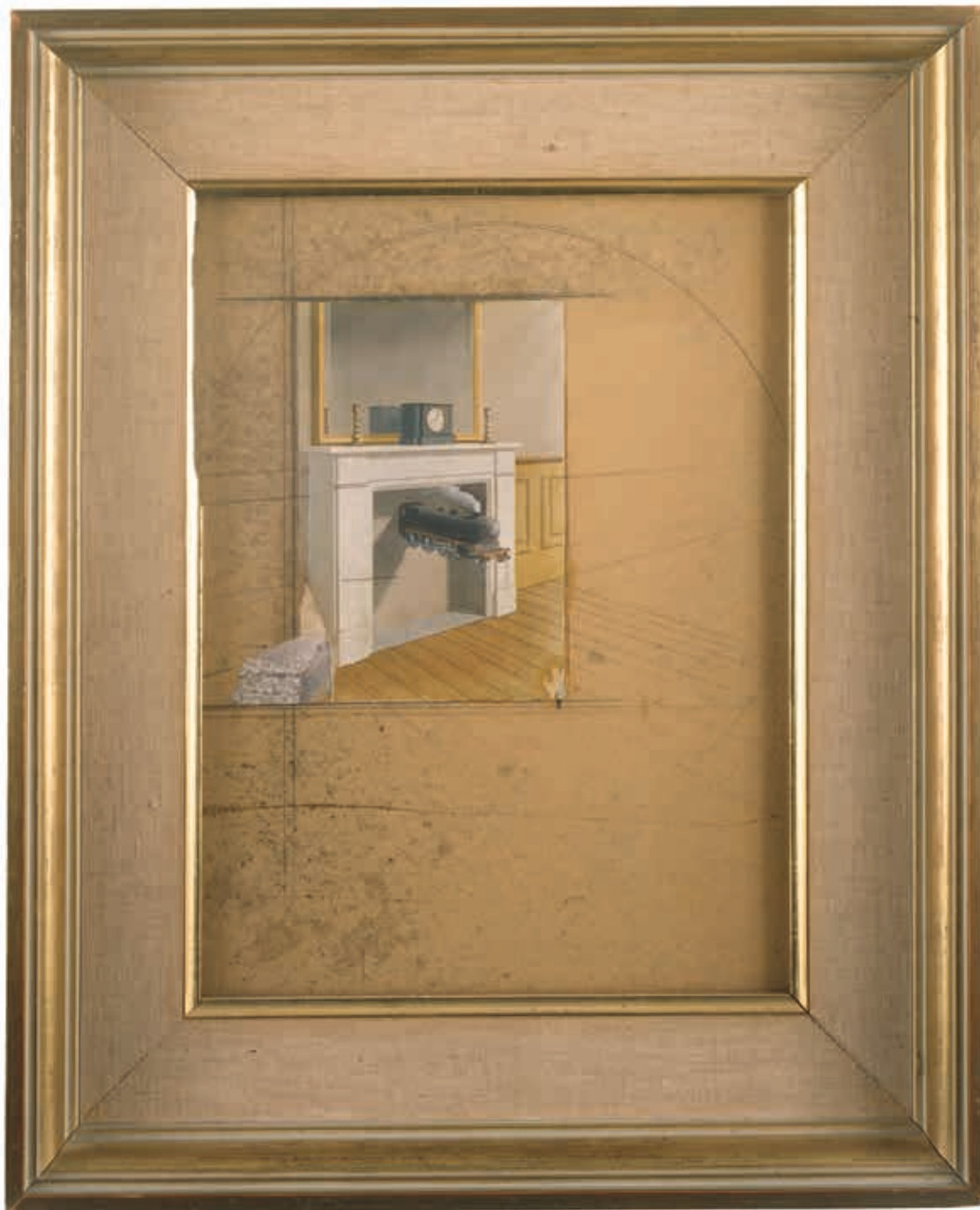
Cat. 77 Mica Magritte II: Time Transfixed , c. 1965 Collage on board, 30.5 x 22.9 cm