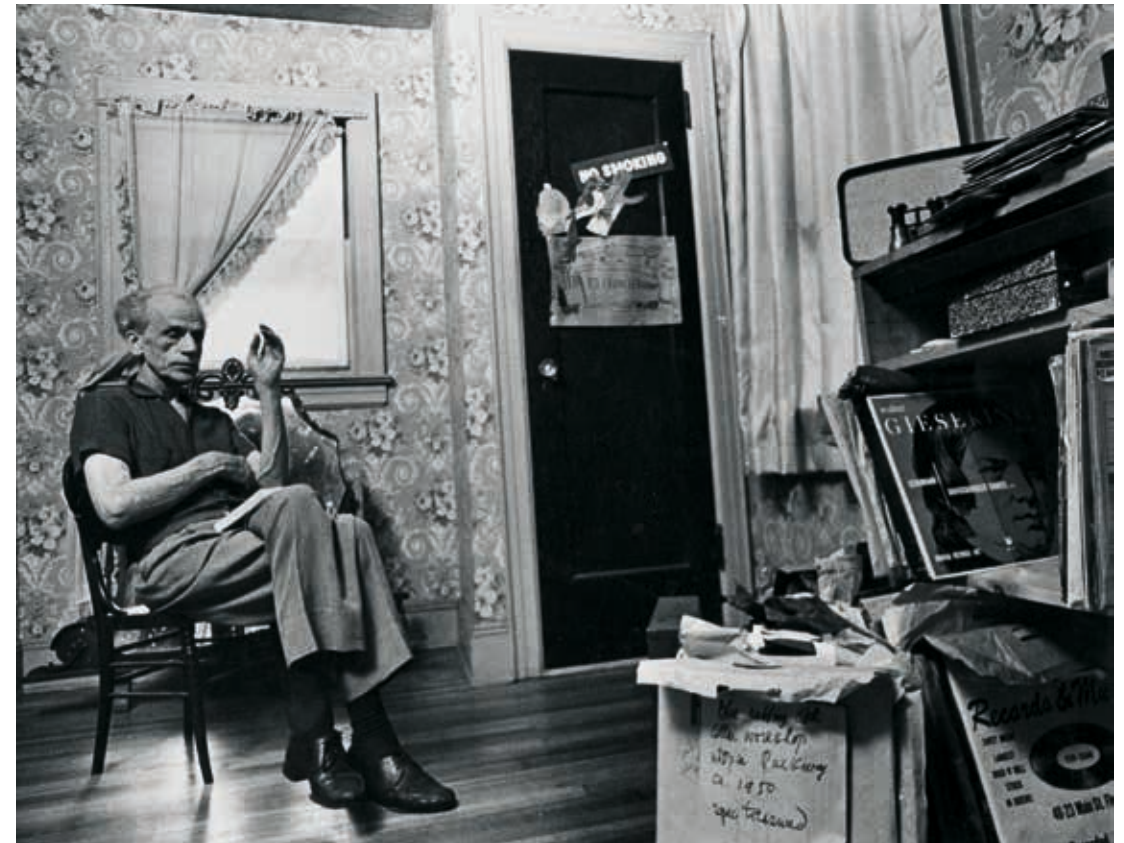
Fig. 1 Joseph Cornell, 1969

Joseph Cornell (1903–1972), born on Christmas Eve in Nyack, New York, remains one of the most enigmatic yet influential American artists of the twentieth century. Almost entirely self-taught as an artist, Cornell lived quietly for most of his life with his mother and younger brother, crafting in the confines of his basement or on the kitchen table the 'shadow boxes' for which he is best known (fig. 1).