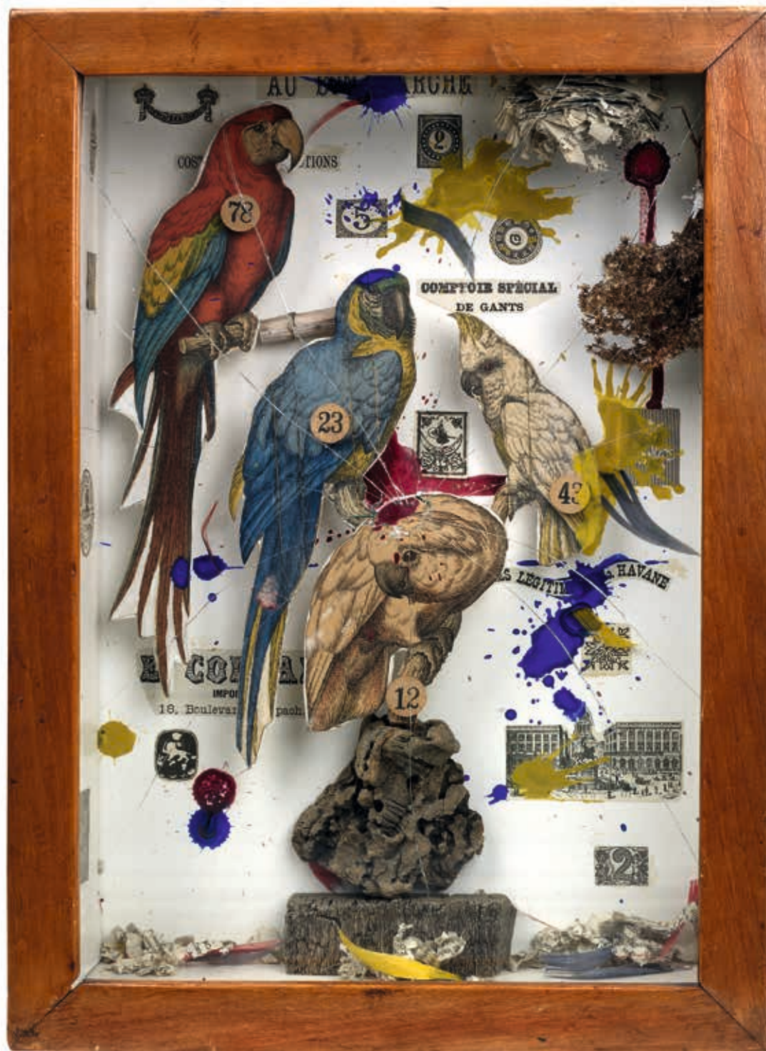
Cat. 41 Habitat Group for a Shooting Gallery, 1943 Box construction, 39.4 x 28.3 x 10.8 cm

Des Moines Art Center, Iowa. Purchased with funds from the Coffin Fine Arts Trust; Nathan Emory Coffin Collection of the Des Moines Art Center, 1975.27 Photo Des Moines Art Center. Photography: Rich Sanders © The Joseph and Robert Cornell Memorial Foundation/VAGA, NY/ DACS, London 2015