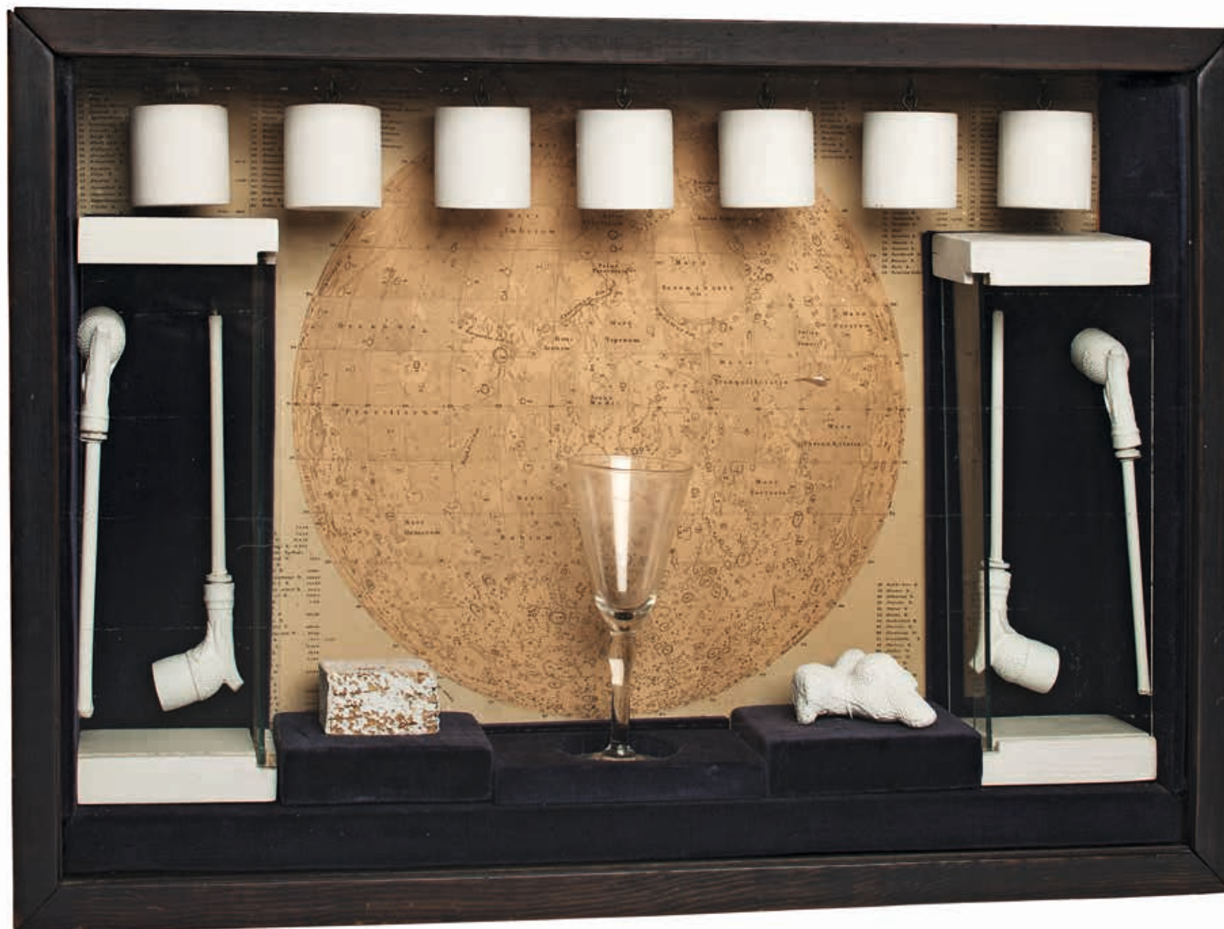
Cat. 51 Soap Bubble Set, 1948 Box construction, 36.8 x 52.1 x 9.8 cm