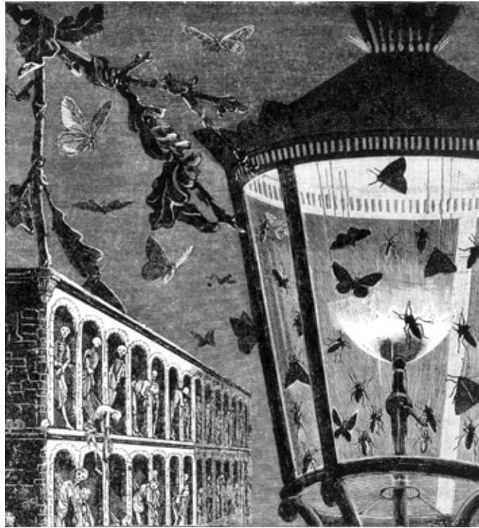
Fig. 2 Max Ernst And the Butterflies begin to sing (Und die Schmetterlinge beginnen zu singen) , 1929 Collage from La femme 100 têtes , plate 120 25 x 18.5 cm

After viewing a number of Cornell's small surreal collages, such as Untitled ( Schooner ), 1931, Julien Levy invited him to show in his exhibition, 'Surréalisme',