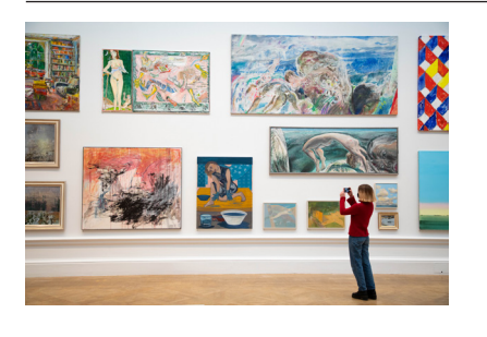
Summer Exhibition 2022

29 January – 17 April 2022 Main Galleries