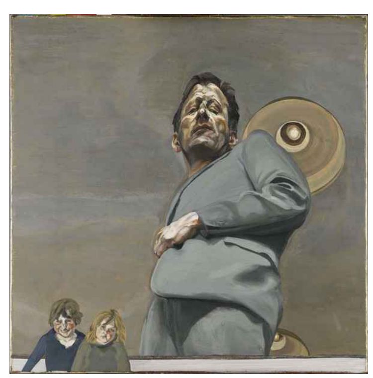
© The Lucian Freud Archive / Bridgeman Images