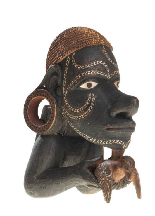
Photo: Derek Li Wan Po © Vb 7525; Museum der Kulturen Basel; all rights reserve