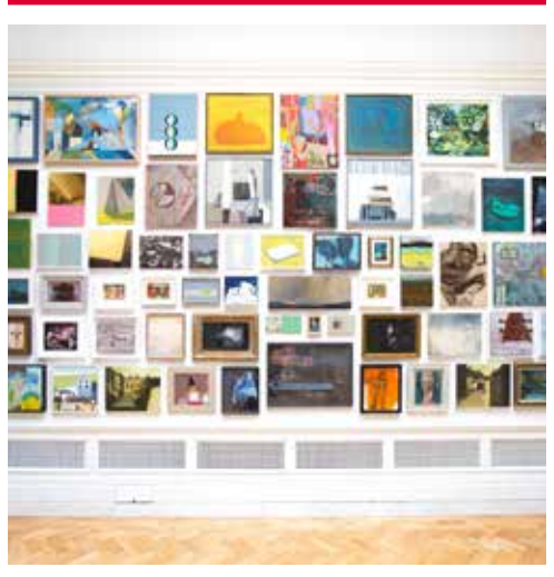
Summer Exhibition 2015